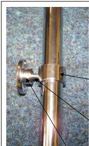
Fig.3. Secure the wall bracket in pre-marked position by screwing to the wall. Screw the threaded peg into the tube ring. Cut the peg to length to gain the desired projection from wall. Push the exposed end of the peg into the wall bracket and secure with grubscrew. Repeat for the other wall fixing.