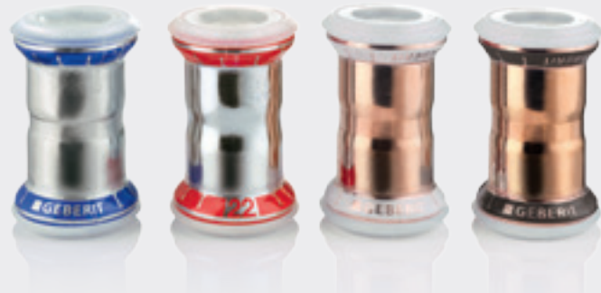
Geberit Mapress comes in 4 different materials; copper, stainless steel, carbon steel and CuNiFe

Press fitting is fast becoming the installation method of choice for installers keen to achieve a professional, speedy and reliable turnaround on both large and small jobs. But despite its simplicity, training is still essential in order to let installers get the best from every application.