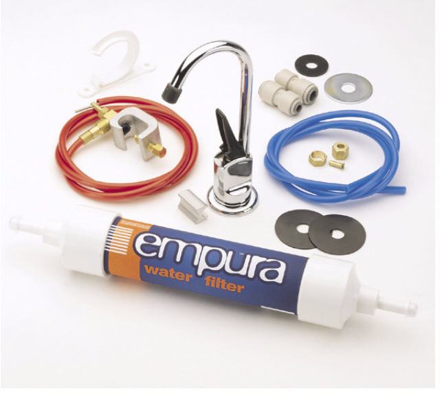
6" (152mm) tap