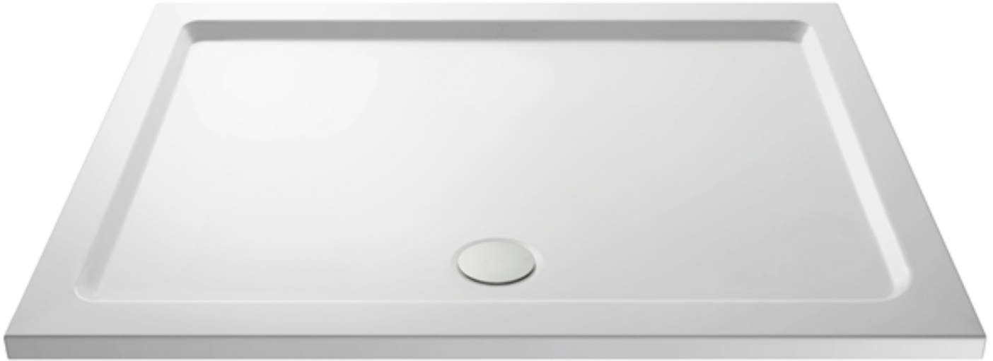
NTP034 - 1400 x 900 RECTANGULAR TRAY

DESCRIPTION: Rectangular Tray 1400X900x40