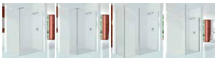
Showerwall with Straight Stabilising Bar (A)

Note: For panels over 1000mm a straight bracing bar is recommended