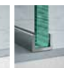
(I) U Channel